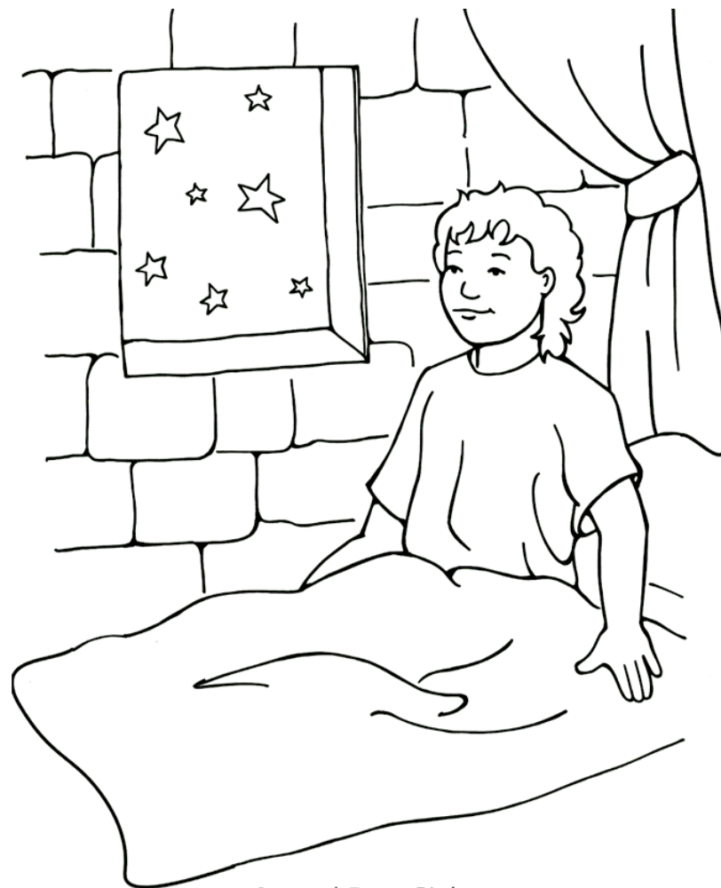
Samuel Does Right 1 Samuel 2-4, 7