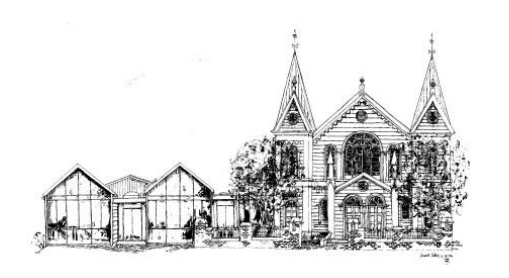
Wesley Wellington 75 Taranaki Street www.wesleychurch.org.nz